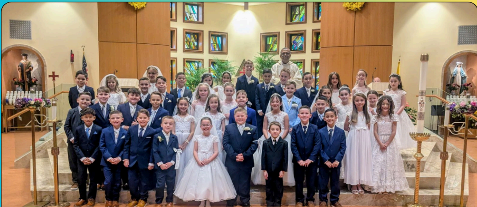
Our second round of First Holy Communion! Please pray for all these children and the catechists who are guiding their faith education.